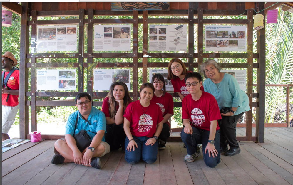
SHS Representatives at the launch

The project started from last June and we would like to thank everyone who pitched in for helping rebuild Ah Ma Drink Stall.