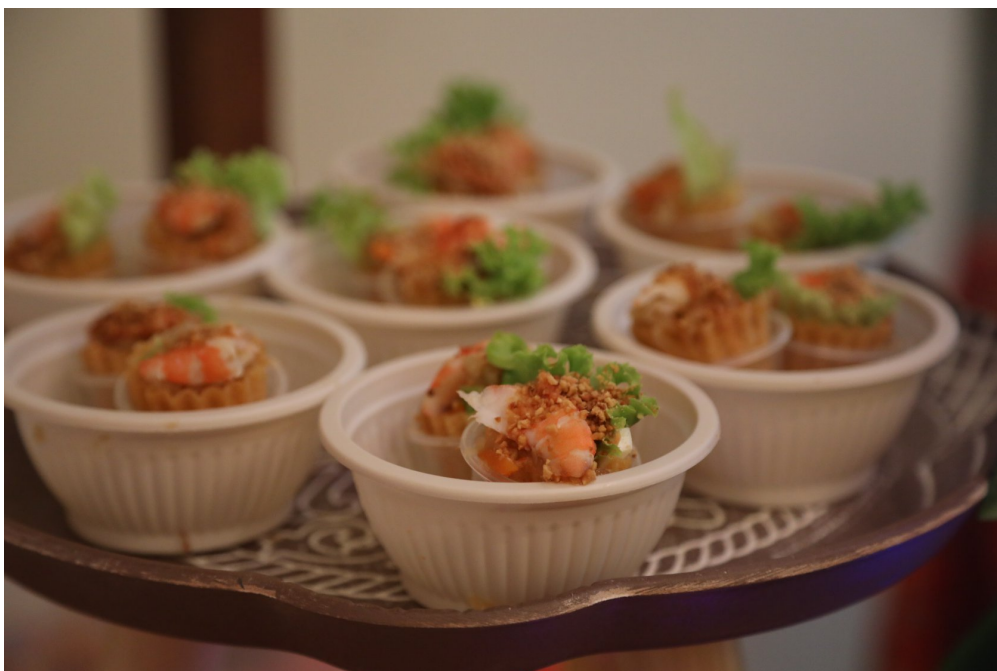
Kueh Pie Tee from Chilli Api Catering

Chilli Api Catering was extremely generous to sponsor the catering for the event. They prepared a number of Peranakan delicacies which disappeared quite rapidly!