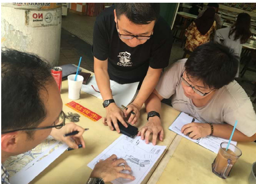
SHS team studying maps of conservation zones.

Commencing in the first quarter of 2016, SHS has commissioned Ethnographica Pte Ltd, an anthropological research consultancy to carry out a two-year research study of 21 historic sites of worship of different faiths, dating from 1824 to 1934, of which only 9 are currently protected as national monuments. As sites of living heritage, these places of worship provide social anchors for historically continuous communities who transmit collective knowledge and shared memories from generation to generation. In this process, they become the custodians of intangible cultural heritage – a crucial dimension of heritage that is in urgent need of research. Adopting the Historic Urban Landscape approach recommended by UNESCO, this project will integrate tangible and intangible cultural heritage, as well as integrate heritage structures and practices across cultures and sites. This project aims to contribute to the further development of a conservation paradigm that goes beyond the piecemeal conservation of isolated sites. This has been granted a $120,000 Heritage Research Grant from the National Heritage Board.