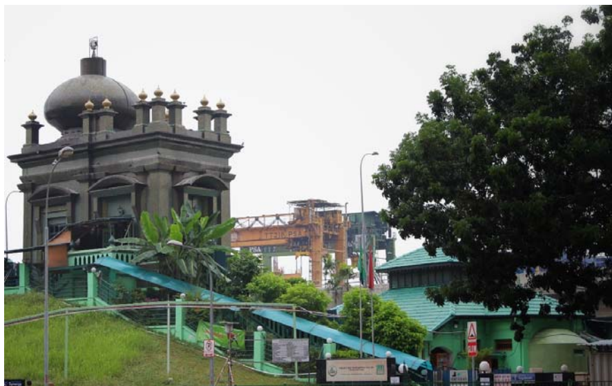
Keramat Habib Noh and Masjid Muhd Haji Salleh at Tanjong Malang.

LTA has invited SHS representatives to four engagement sessions between Oct 2015 and July 2016, which were also attended by NHB and URA. During these meetings, we were briefed on transportation infrastructure development plans (bus terminal and MRT) at the Tanjong Malang site. SHS has provided scholarly research information on the historic value of the site and strongly recommended consideration of the historic architecture and community use of the site in the construction phase, the design of the MRT station exit, urban design and landuse around the bus terminal and MRT exit. In addition, public awareness of the history of Tanjong Malang can be raised through displays inside the completed MRT station and through naming the station using the vernacular 'Tanjong Malang' rather than the current working name, 'Prince Edward Station'. SHS also introduced to LTA the architecture academics, Associate Professor Johannes Widodo and Dr Imran Tajudeen, who had organised a public seminar on the history of Tg Malang under the Singapura Stories banner, in order to share their knowledge and feedback.