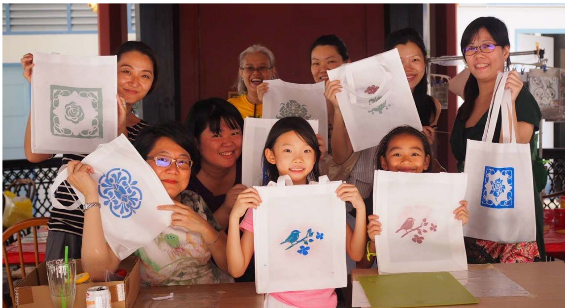
Screen printing on fabric workshop, 20 Aug 2016 at Chong Wen Ge.