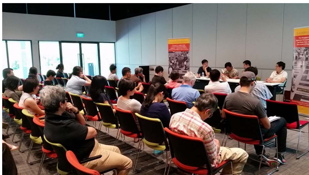
'Singapore: Literature x History Panel Discussion', 9 July 2016.