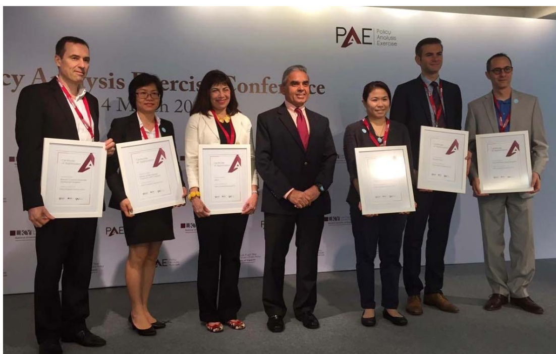
Certificates of Appreciation being presented to SHS and other client organisation participating in KYSPP's Policy Analysis Exercise 2016, 4 March 2016.