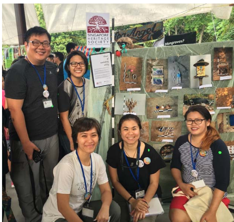
The Island of Everlasting Utility photo installation at Ubin Day, 4 June 2016. (Photo: Chua Ai Lin)

http://invisiblephotographer.asia/2016/07/19/islandeverlastingutility-claricelee/