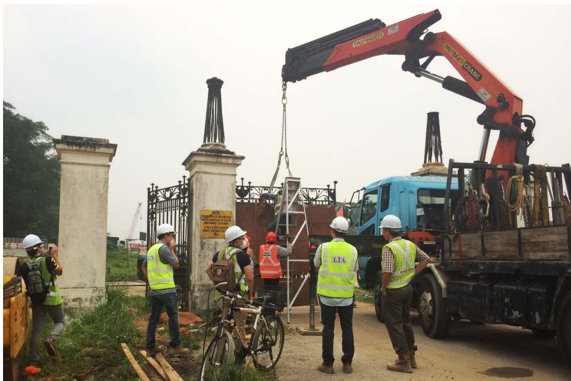
Removal of old Bukit Brown gates for restoration, 28 Sep 2015.