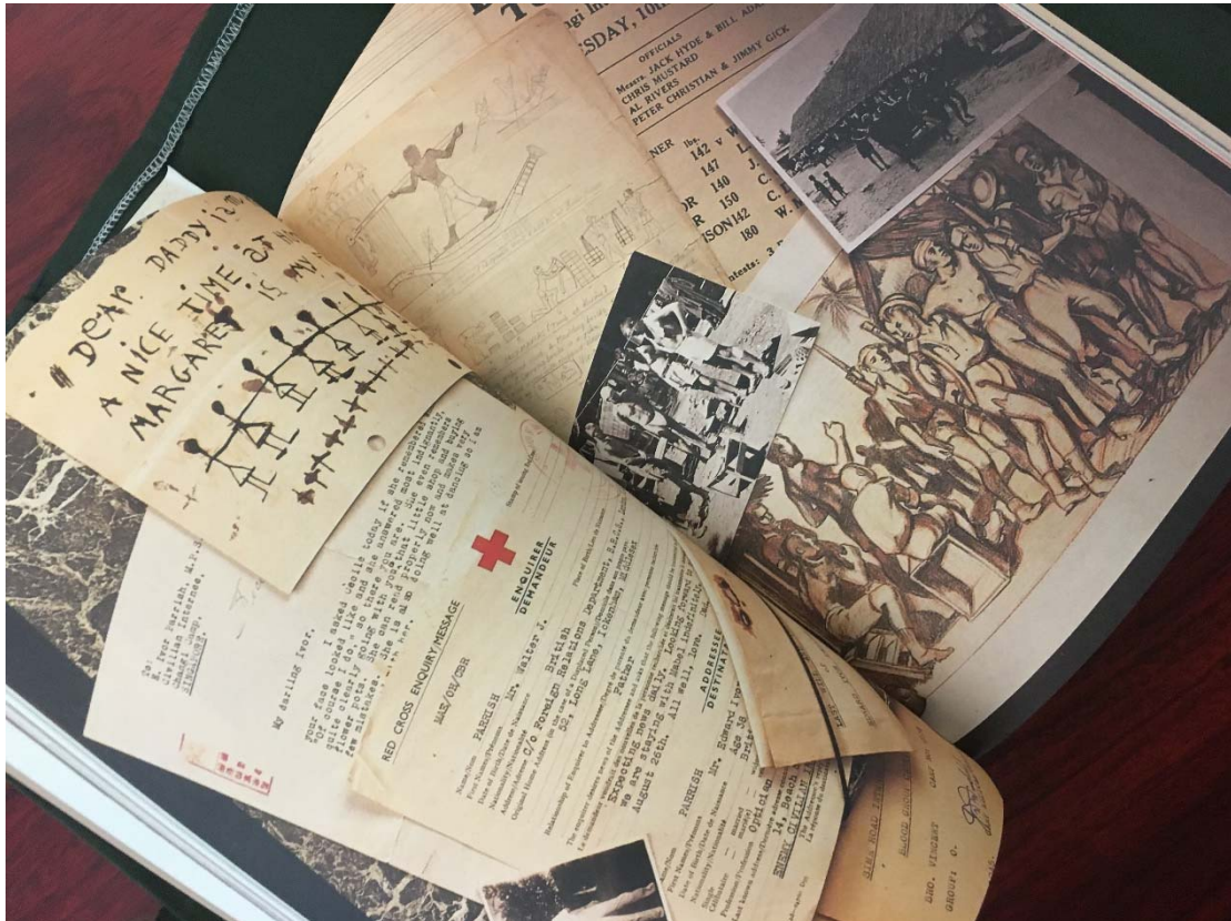
The original 1992 version of Syonan: Singapore under the Japanese, 1942-1945.