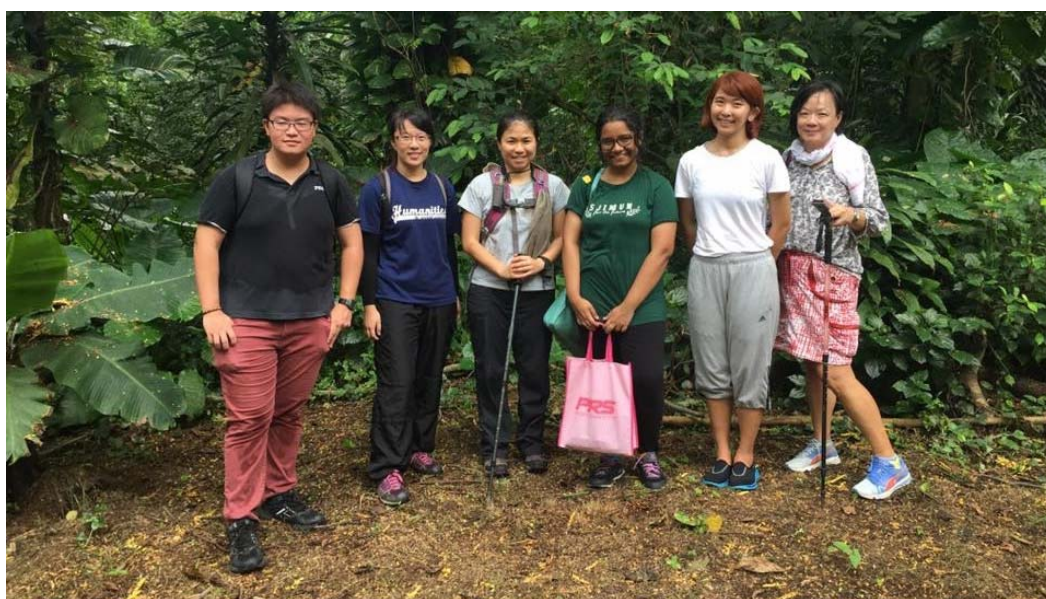
SHS interns accompany SHS Exco members to visit Bukit Brown, 14 Aug 2016.

Following a very positive experience with several general interns, as well as project-based internships from January to August 2015, SHS embarked on its first ever public call for general interns in December 2015, and a second call in July 2016. Each round has attracted about 12 applicants from a variety of backgrounds, ranging from junior college to Master's level students, and majoring in social sciences, humanities, business administration and even Mechanical Engineering. Seven interns were selected for the first call, and four for the second call.