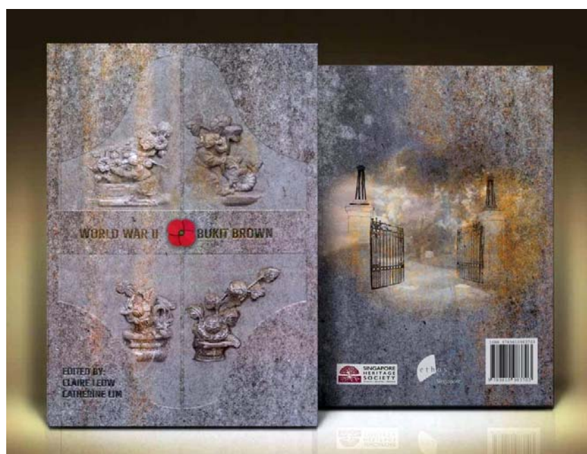
Cover of World War II at Bukit Brown

As of 30 August, the book has already sold over 600 copies.