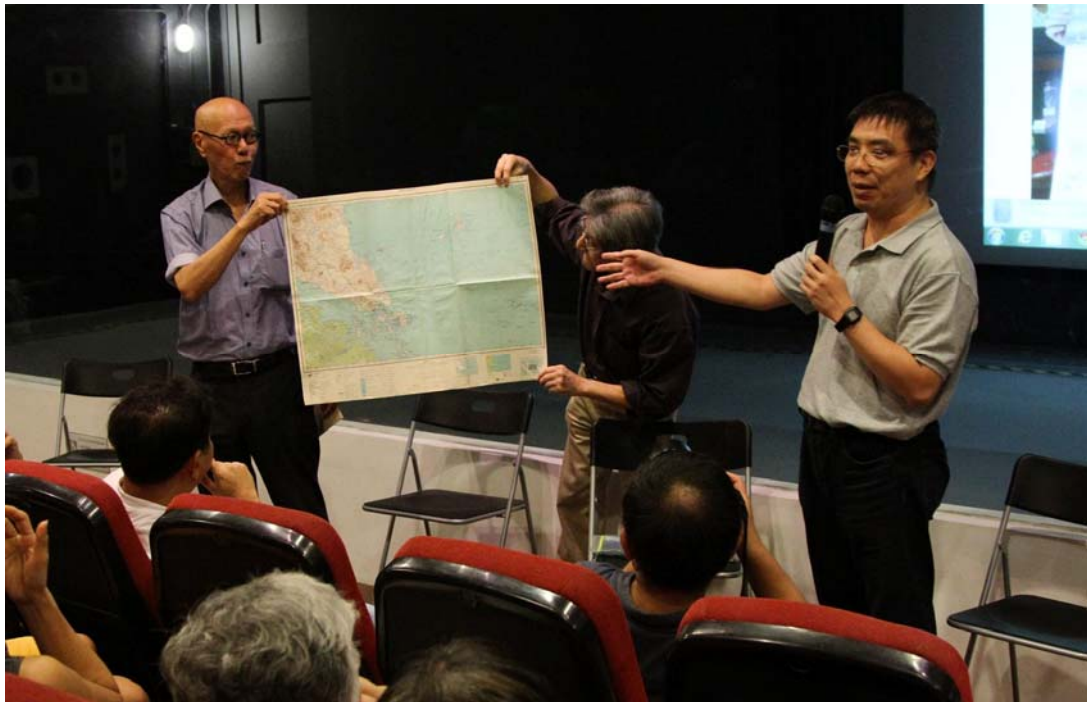
A show and tell of World War II artefacts at 'Cakap Heritage: Mementos and Memories' at Memories of Old Ford Factory, 3 Oct 2015.

'Mementos and Memories', co-organised with National Archives of Singapore (NAS), 3 October 2015 at Old Ford Motor Factory.