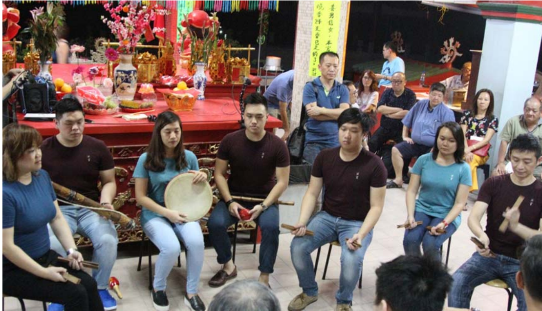
With the Siong Leng Musical Association on their annual pilgrimage to Kusu Island, 24 Oct 2015.

Founded in 1941, the Siong Leng Musical Association carries on the living heritage of Nanyin music, a Hokkien genre which is inscribed on UNESCO's list of Intangible Cultural Heritage. The Association performs at traditional temple festivals, the Esplanade and public outreach workshops. Siong Leng is one of our Bukit Pasoh placemaking partners where their premises with a small museum are located. They also invite SHS to join private events such as their annual Kusu Island pilgrimage and yearly gala dinner.